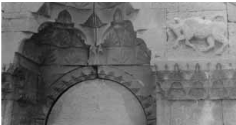
Picture 9. Door aperture of the Caravansary in Selim pass. Zangezur