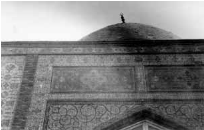
Picture 12. Facade of the General mosque in Irevan.