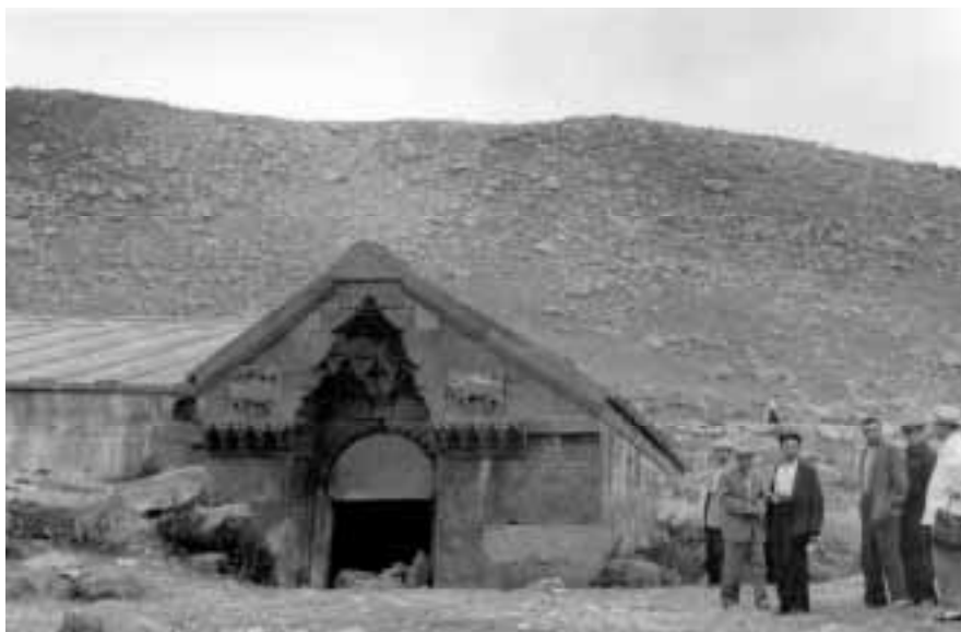
Picture 8. Caravansary in Selim pass. Zangezur. General view