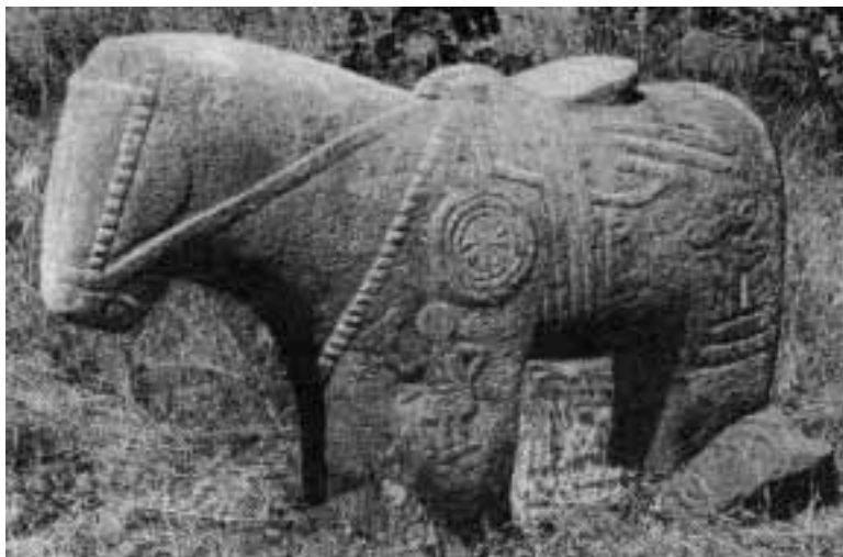
Picture 14. Malibey village of Lachin rayon of Republic of Azerbaijan. An image of a seal on a horse's hip (XVI-XVII centuries.)

Chest-shaped memorials, stelas, phallus-like stone effigies of horse and sheep (mentioned by S. Karapetian as well) of 14 th -19 th centuries with Arabic-Persian-Azerbaijani language inscriptions and reliefs on them, reflect different aspects of everyday life, questions of toponymy, history of folk medicine, ethnogeny of Azerbaijani people; they highlight other issues of medieval Azerbaijan's cultural life.