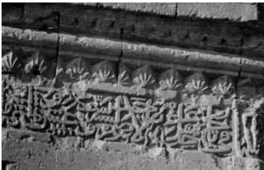
Picture 7. Mausoleum of Karakoyunlu Emirs in Jafarabad. Fragment of an inscription