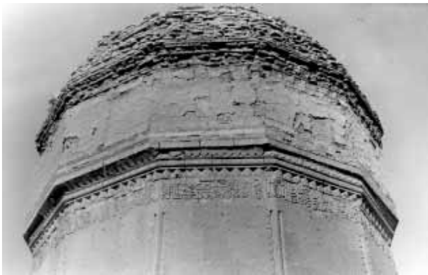
Picture 6. Upper facade of the mausoleum of Karakoyunlu Emirs in Jafarabad