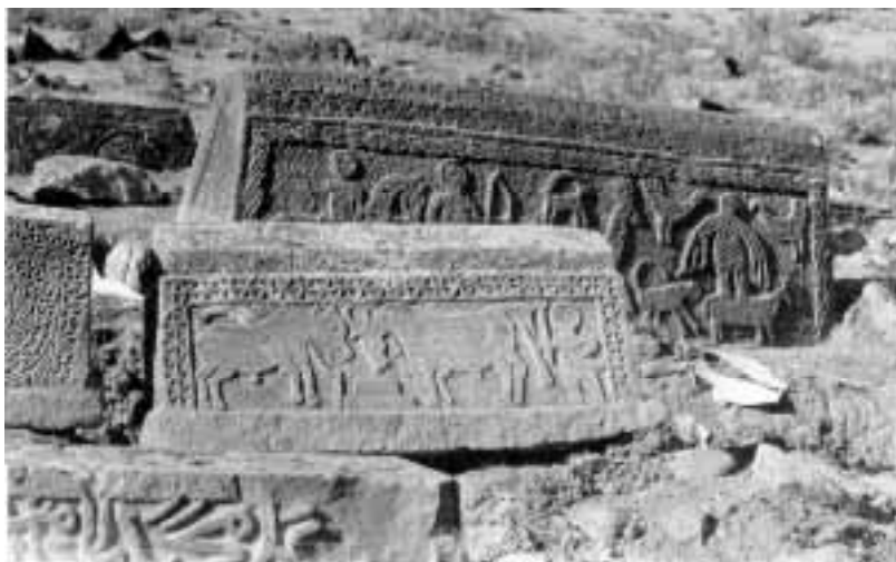
Picture 3. Medieval necropolis in Urud village. Depictions of ongons of ancient Turkic tribes