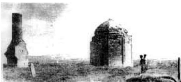
Picture 15. Babi village. Sheikh Babi Yagub mausoleum, 13 th century. Fizuli rayon of Azerbaijan.

While researching stone effigy of a horse in Malibey village of Lachin rayon, Corresponding-member of National Academy of Sciences of Azerbaijan M. S. Neymat had discovered images of solar symbol and a figure of a man with a bird on his right hand. As we know, ancient Turks worshipped goddess Umay, who protected children. Traditional depiction on monuments and structures of a man with bird on his hands could be perceived as a sign to protect them from destruction and damage. There are stone figures of horses with similar relief images left in Gulebird village as well.