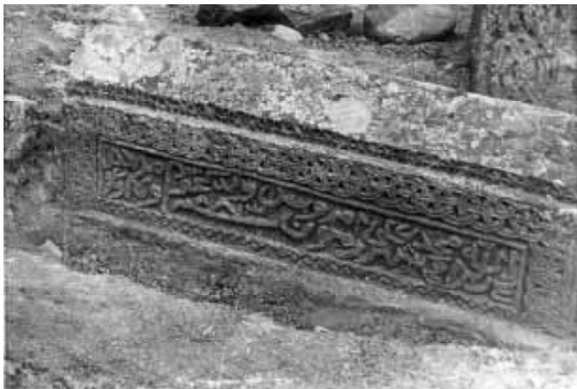
Picture 2. Medieval necropolis in Urud village. Tombstone