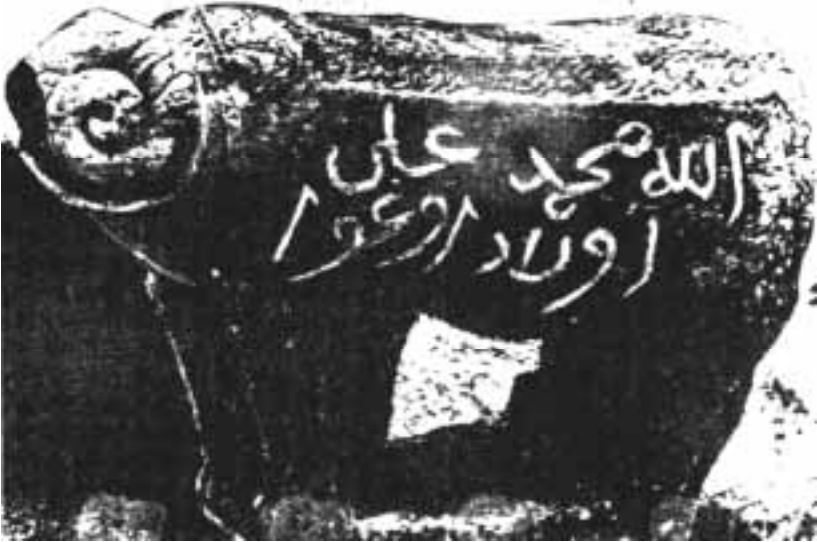
Picture 4. Medieval necropolis in Urud village. Stone effigy of a sheep

The same happened in 19 th century, and continues in our days. Nowadays there is not a single Azerbaijani on the historical Azerbaijani territories – Western Azerbaijan, Zangezur, Irevan gubernia, which constituted newly formed Republic of Armenia in 1920. Nowadays monuments of Azerbaijani material culture, those witnesses of centuries, throughout which these lands had belonged to Azerbaijanis, are being defiled, abused, and annihilated by Armenians.