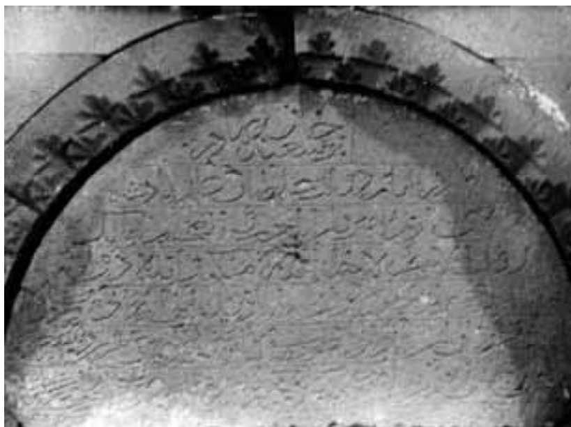
Picture 10. Caravansary in Selim pass. Zangezur. An inscription in Arabic-Persian language with Turkic-Mongolian names.