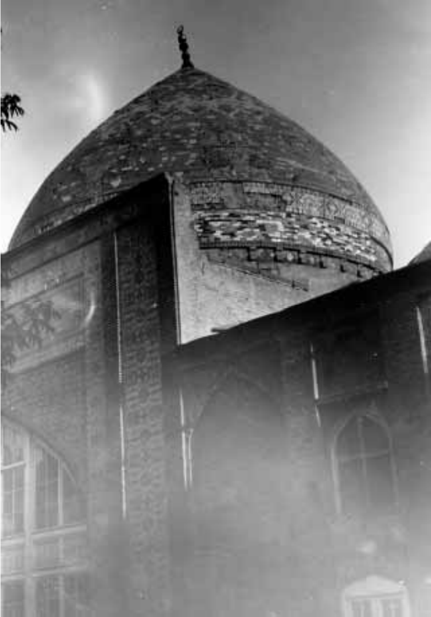
Picture 13. Rear view of the General mosque in Irevan