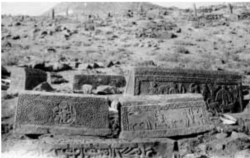
Picture 1. Medieval necropolis in Urud village. General view