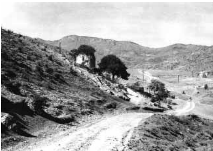
Picture 17. Shikhlar village. Shikhbaba mausoleum. Cabrayil rayon of Azerbaijan.

In old cemetery of Khodjaly village of Cabrayil rayon M. S. Neymat discovered fragment of building inscription with handwriting of large and beautiful Suls (Islamic calligraphic script) on it. Near this cemetery, another two stelas had been found. On top side of them, images of animals – mountain goat, argali (wild sheep) – were carved, as well as different seals, which remind us of images on the rocks of Gobustan and Absheron.