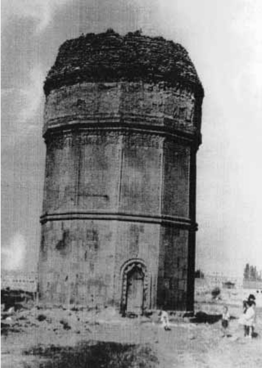
Picture 5. General view of the mausoleum of Karakoyunlu Emirs in Jafarabad village